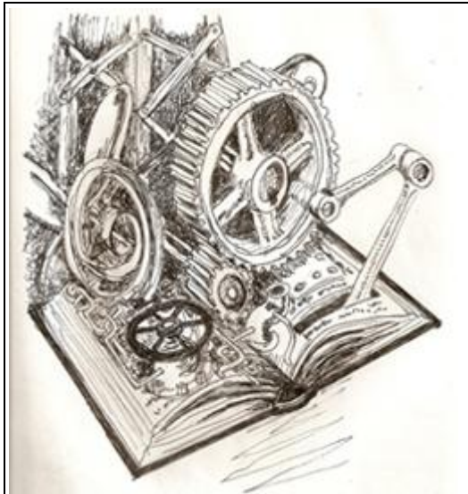
The first mechanical book was created in the mid-13th century by an English Benedictine monk named Matthew Paris. This illustration is not an accurate representation - just a strange example of what might happen if you combined gears with books!

If you can't grab their attention, it doesn't matter how well you've written the article. Many people will simply glance at the text and move on to something more interesting.